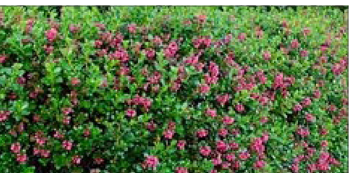
Choose flowering Escallonia for a coastal hedge.