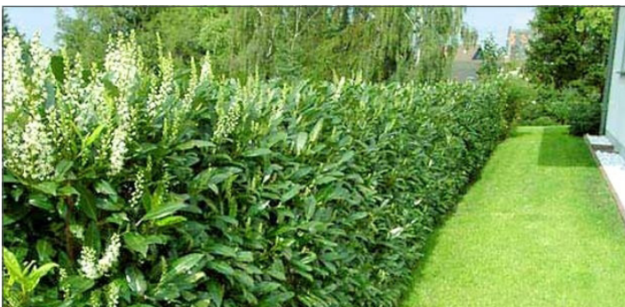
Laurel is a very popular evergreen hedge (Prunus).