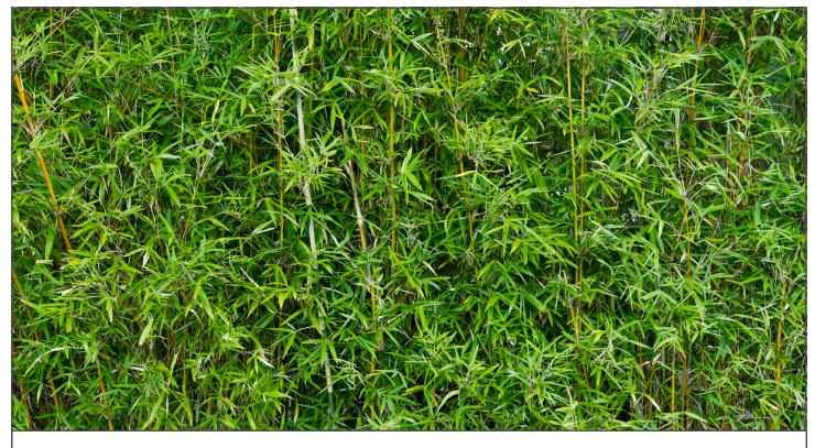
Bamboo is a fast growing hedge.