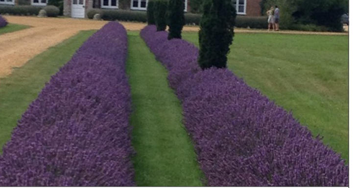
Lavender (Lavendula) makes a nice informal scented hedge.