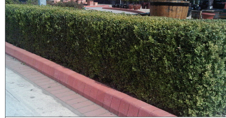
Create a nice formal boundary with box (Buxus) hedging.