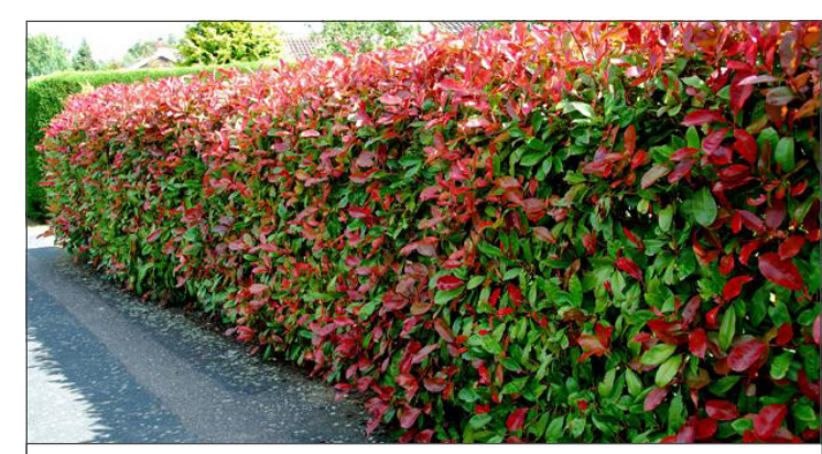
Choose Photinia for colourful foliage.