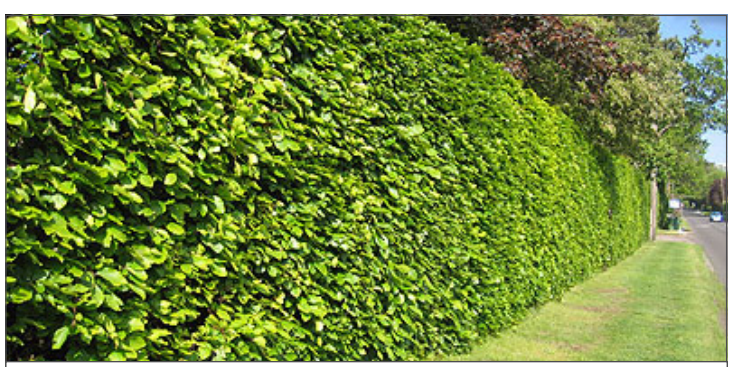
Choose a low maintenance green Beech ( Fagus ) hedge.