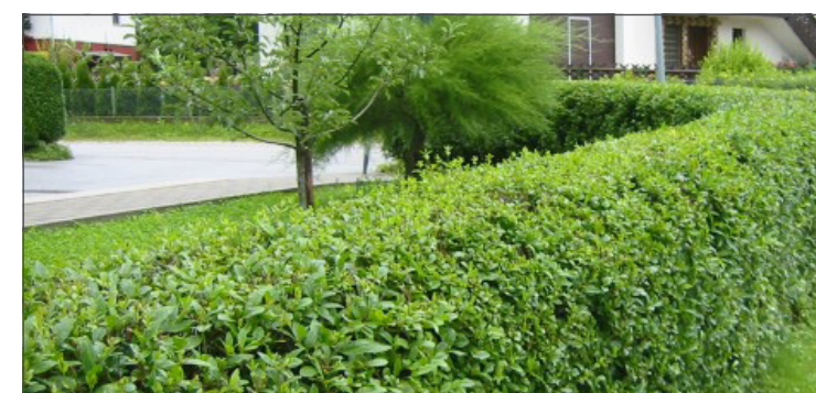
Privet (Ligustrum) is good and hardy.